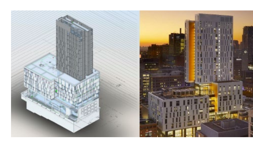
PHOTO: EXAMPLE OF DIGITAL TWIN MODEL (LEFT) OF EXISTING BUILDING (RIGHT) FROM BOOTCAMP WORKSHOP